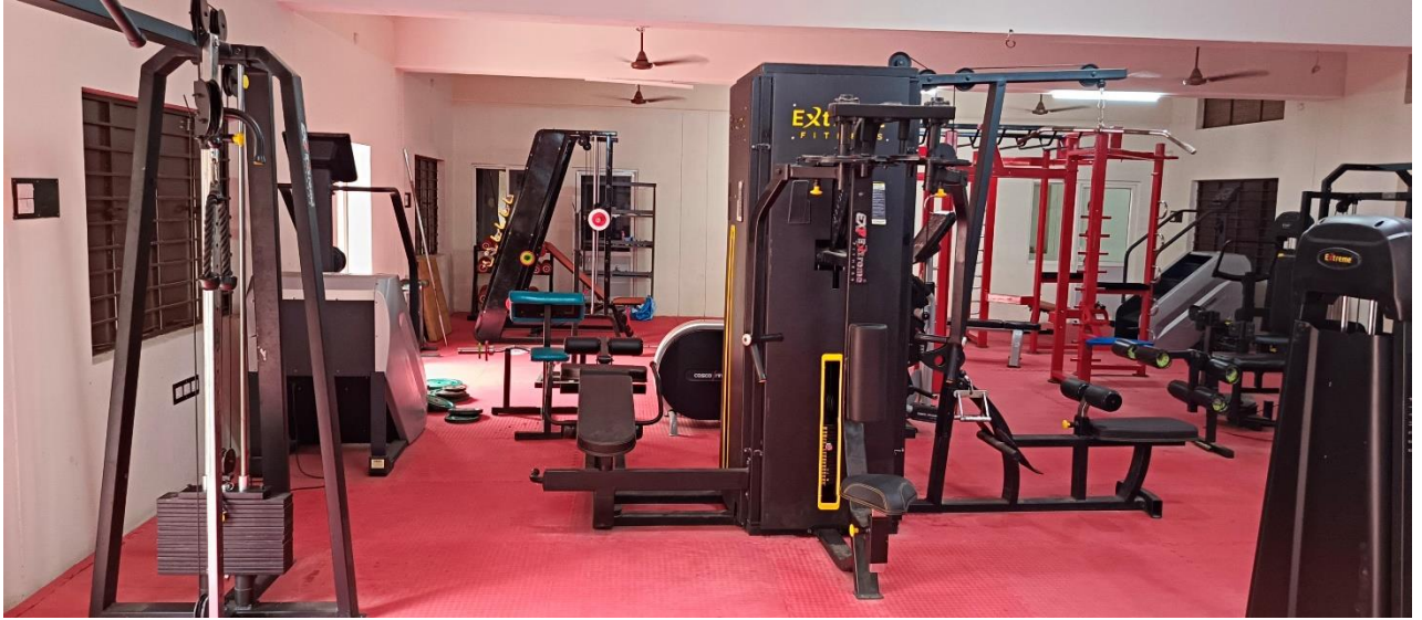
Silver Jubilee Hall